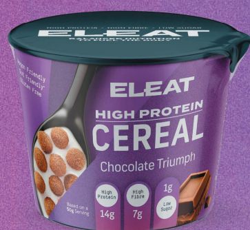
CHOCOLATE 50G POT