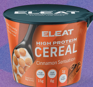
CINNAMON 50G POT